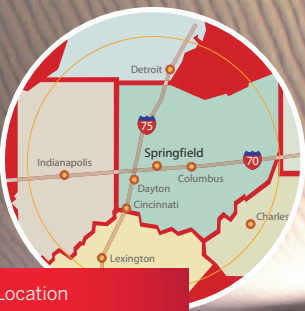
→ Ideal Location

SO MANY WAYS TO GROW YOUR BUSINESS DREAM. THIS IS SUCCESS IN GREATER SPRINGFIELD.