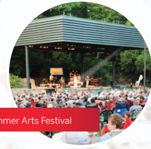
→ Summer Arts Festival