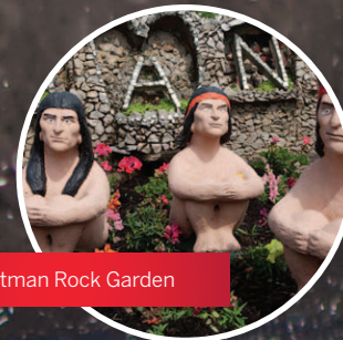
→ Hartman Rock Garden

CREATIVITY, CULTURE AND DIVERSE DESTINATIONS. THIS IS WHAT WE CALL FINDING FUN, YOUR WAY.