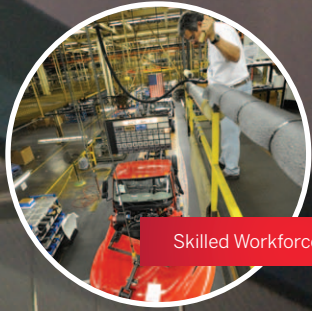
→ Skilled Workforce