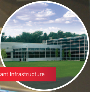
→ Abundant Infrastructure