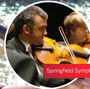
Springfield Symphony →